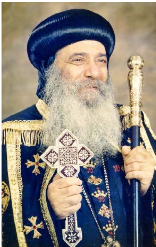
His Holiness Pope Shenouda III Patriarch of the See of St Mark